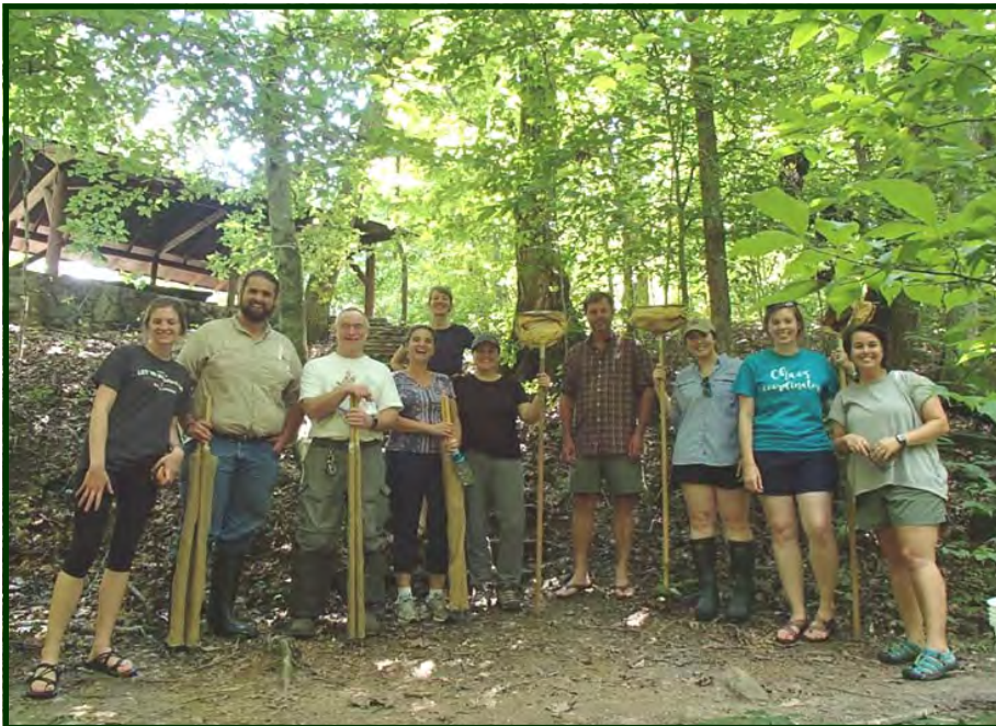
Georgia Adopt-a-Stream Macroinvertebrate Trainer Workshop Participants

In August, Environmental Planning staff attended a Georgia Adopt-a-Stream Macroinvertebrate Trainer Workshop at the Chattahoochee River National Recreation Area in Sandy Springs, GA. Staff received training from GA EPD staff on trainer roles and responsibilities as well as learning techniques for teaching volunteers how to correctly identify and sample for macroinvertebrates to assess water quality in streams. Macroinvertebrates are aquatic insects, mollusks, or crustaceans that live