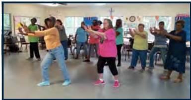
Harris County seniors enjoying an exercise class.

Recently, a Chronic Disease Self-Management (CDSMP) workshop was held at Harris County Senior Center in Hamilton, Georgia. Local Stanford University Leaders facilitated the six-week workshop which encouraged seniors, 60 – 90 years of age, to “self-manage” chronic diseases such as heart disease, arthritis, diabetes, depression, and other physical and mental health conditions. Self-management helps to ensure that seniors, as well as people of any age, live longer healthier lives, remain active and productive, and live independently for as long as possible. This news is impressive, particularly since a subjective study comprised of more than 1,000 people found that people who took the CDSMP, in contrast to people who did not, developed healthier