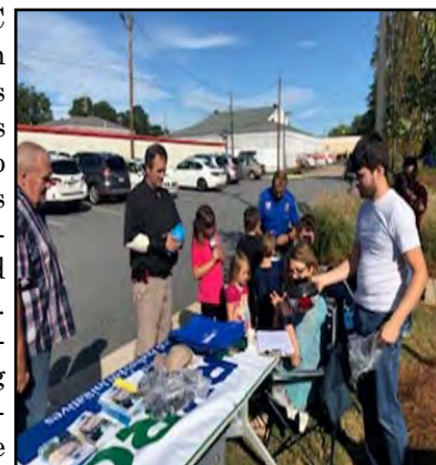
Children's Bicycle Helmet Give-a-Way

October 19 th RVRC staff partnered with SAFEKIDS Columbus and the Columbus Police Department to provide a children's helmet give-a-way during a Mercy Med Farmer's Market. The children were excited to be receiving their free helmet. Bicycle helmets were properly fitted for each child.