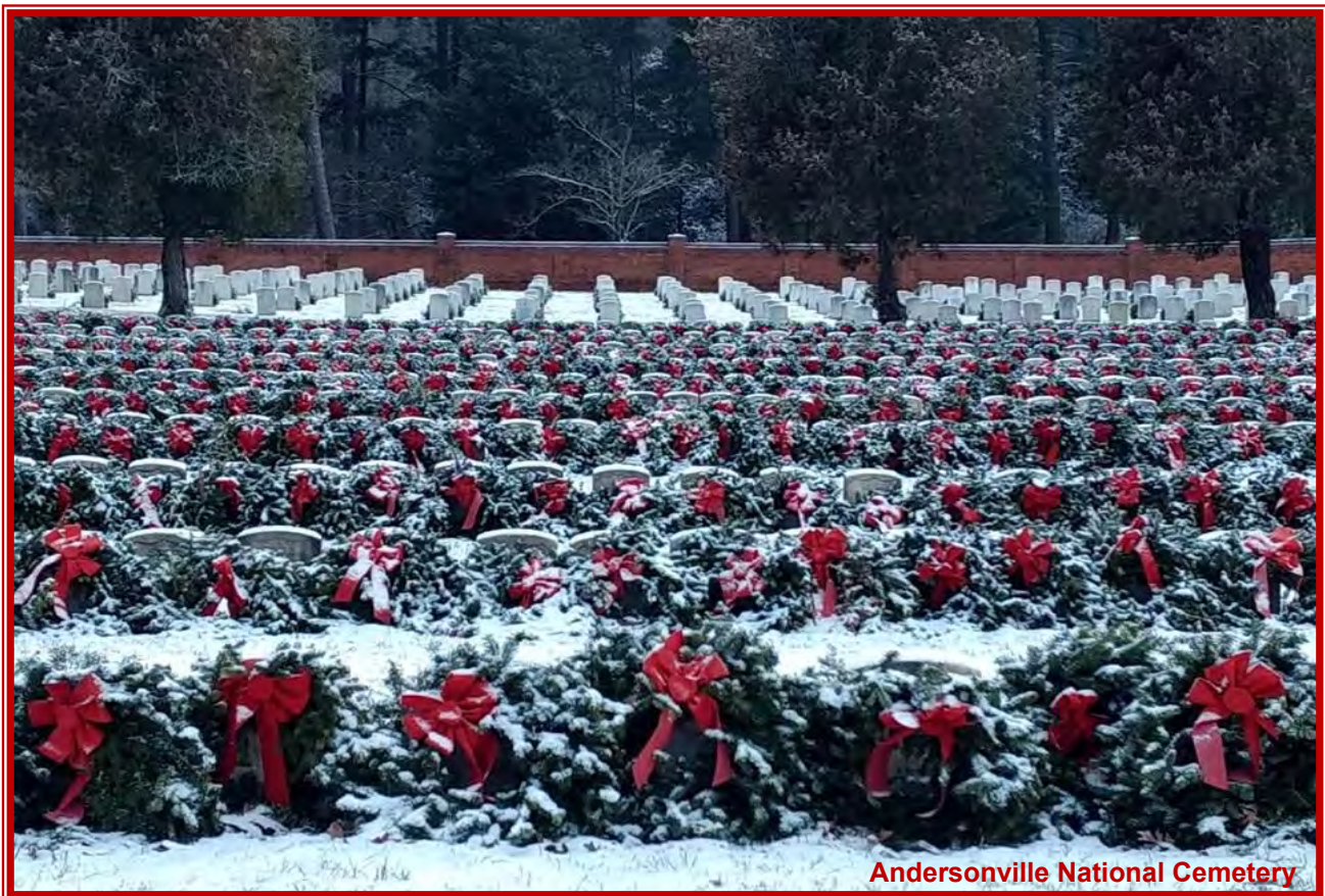
Andersonville National Cemetery