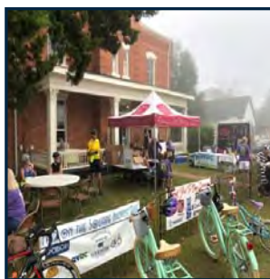
Fair on the Square

On October 20 th RVRC staff and the Stewart County Historical Society held the Fair on the Square Bicycle Ride also known as the Carter Butts Memorial ride. Forty riders came for this event with route options at 20, 50, and 64 miles. After the ride, lunch and drinks were provided to riders during Lumpkin's Fair on the Square activities.