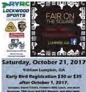
Fair on the Square Event Poster, October 21st Lumpkin, Georgia

The Fair on the Square event, celebrating its 15th year, was a great success with 100 riders participating in the event on October 21st. Funds raised were designated to help restore the old jail. Also, the Stewart County Historic Commission received a $5,000 grant from the Community Foundation of the Chattahoochee Valley to permanently designate 3 routes for bicyclists, naming them the Carter Butts Memorial Bicycle Route.