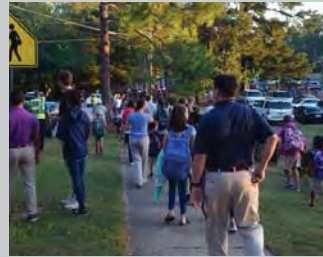
Walk to School Participants Clubview Elementary School

On October 4th, Clubview Elementary School and Richards Middle School celebrated international walk to school day in Columbus. Walkers were encouraged and acknowledged by the school marching bands who performed at the school entrances. Parents, teachers, students, school administrators and community members attended the event for a collective participation of 300 people at both school campuses.