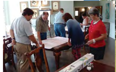
Regional Plan Meeting - Lower Chattahoochee Council of Governments