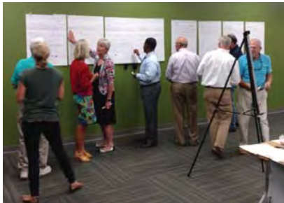
Regional Plan Meeting - RVRC Columbus Office

Representatives from each county create the Leadership Team that will meet prior to RVRC Council meetings through April. Staff also scheduled four Successes, Weaknesses, Opportunities, and Threat (SWOT) Analysis meetings which took place throughout the fall. Any help you can give your RVRC staff with this process is greatly appreciated!