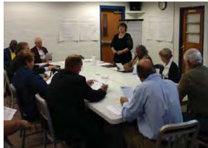
Regional Plan Meeting - Buena Vista