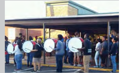
Marching Band, Walk to School Day Richards Middle School